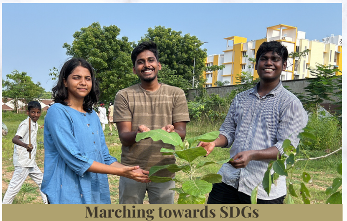
Planting Hope, Growing Change!