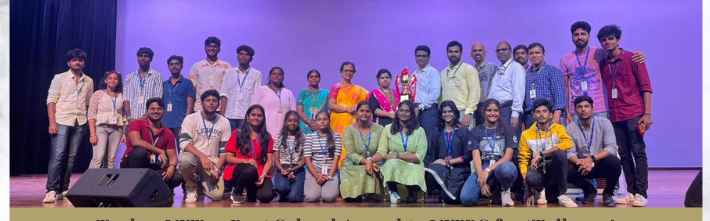
TechnoVIT'23 Best School Award to VITBS for 'Taikuun'