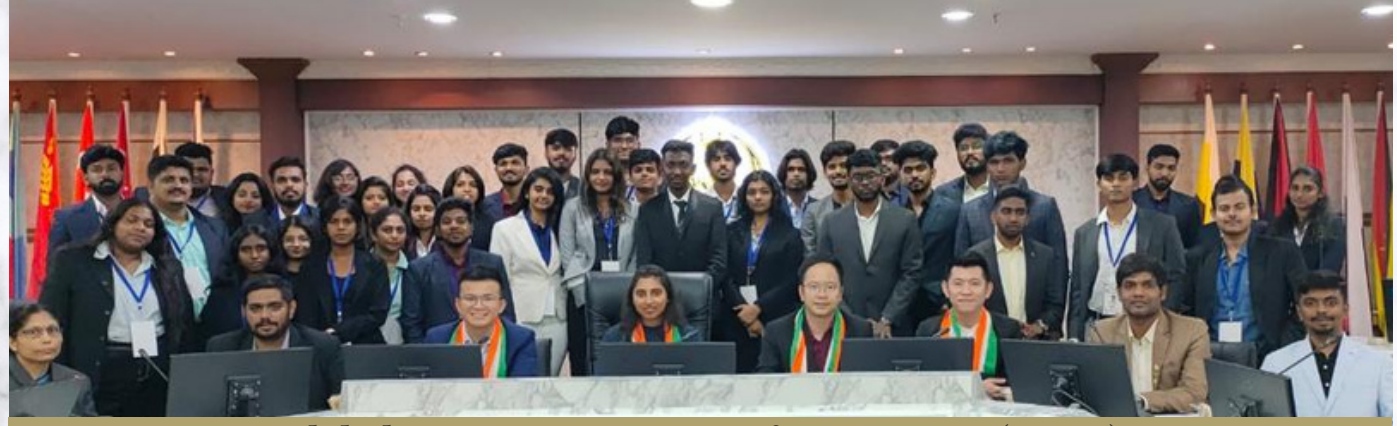
Global Management Immersion Program (GMIP) (Singapore & Malaysia)