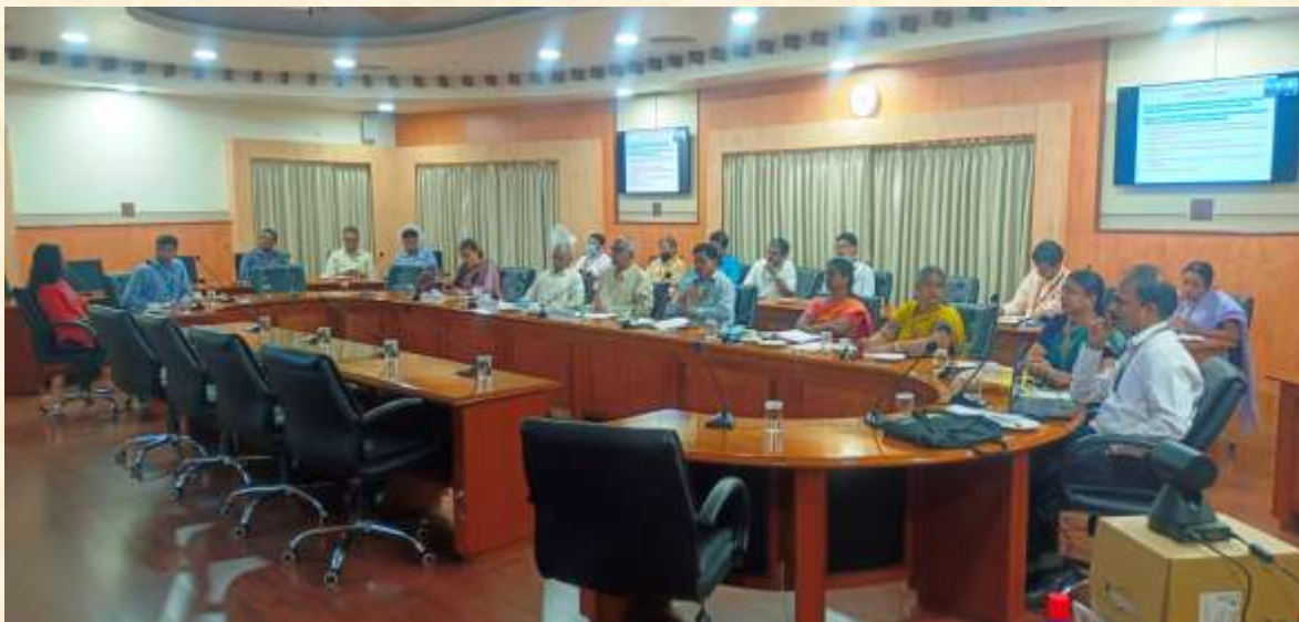
IQAC Meeting held on 27.09.2022 in hybrid mode