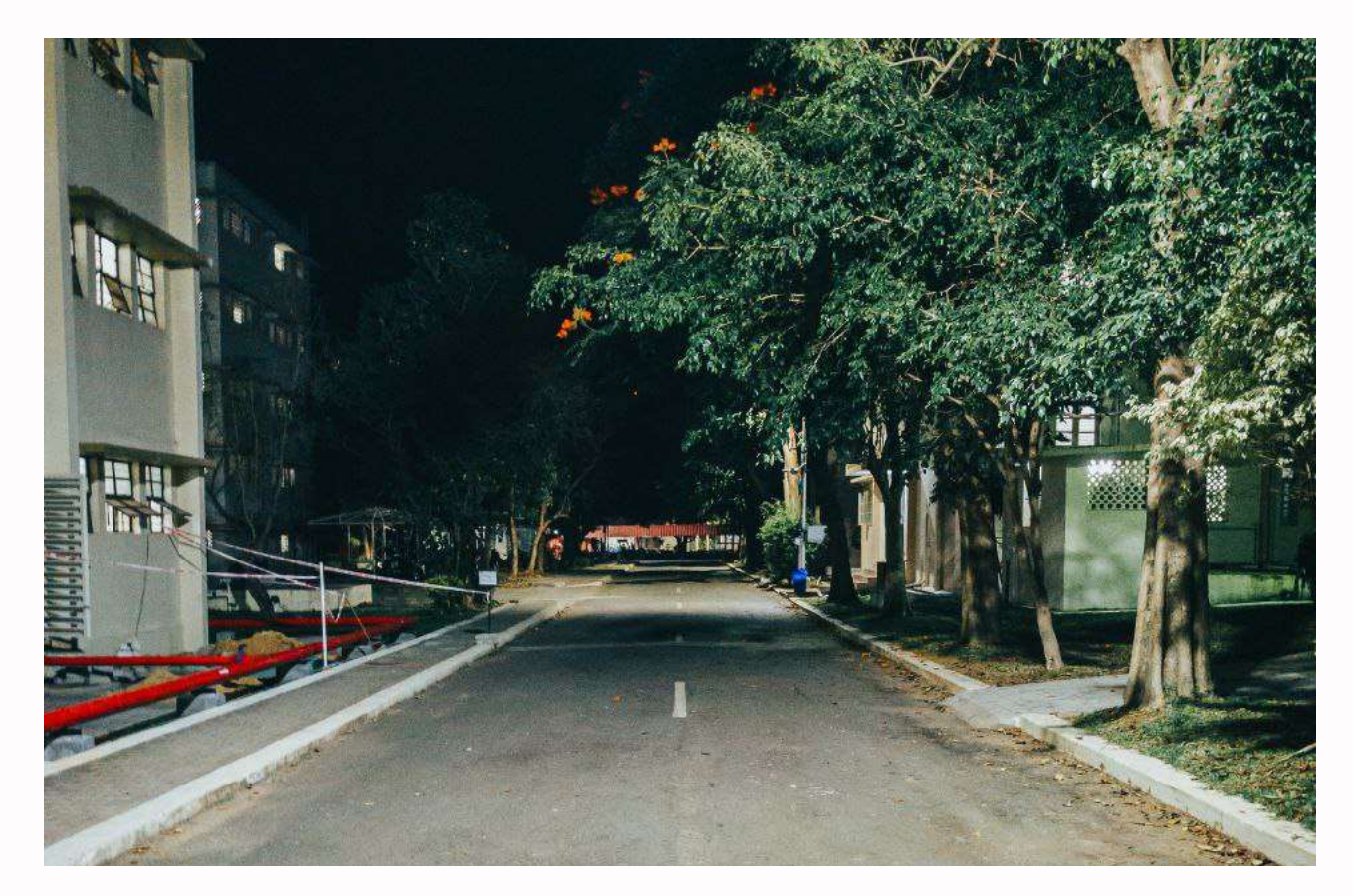
10:00 PM, Walking passage near SMV academic block