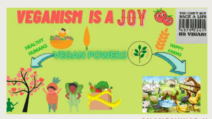
~GNANESHWAR U 21BEI0030