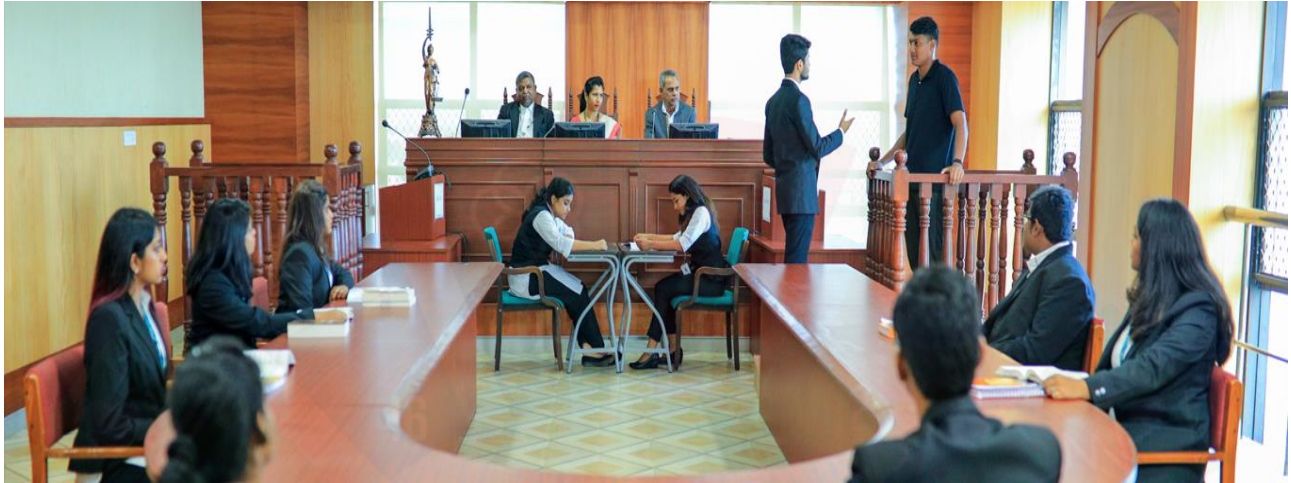
Capacity Building Through Intra Moot Court Training