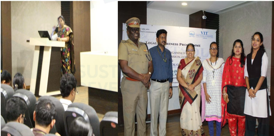
Legal Awareness Programme Jointly Organised By National Commission For Women: 2020

Women and Law: A Legal Awareness Programme (LAP) in collaboration with National Commission for Women was conducted on 03/01/2020 at VITSOL premises in Chennai. The programme was conducted to create awareness among college students, women and men, about women related basic legal rights, remedies and challenges under various criminal, civil and labour laws. The LAP witnessed participation from students and the unorganized sector workers from in and around Chennai.