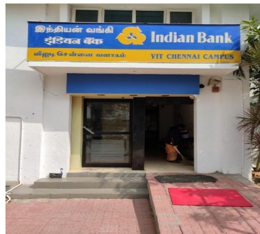
Bank & ATM facility

With clubs, chapters and college festivals, students are exposed to a competitive environment not only within the campus but also outside the campus.