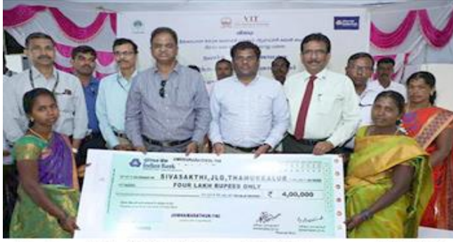
Mega Loan Mela - 01.02.2020 at Jawadhu Hills, Tiruvannamalai District