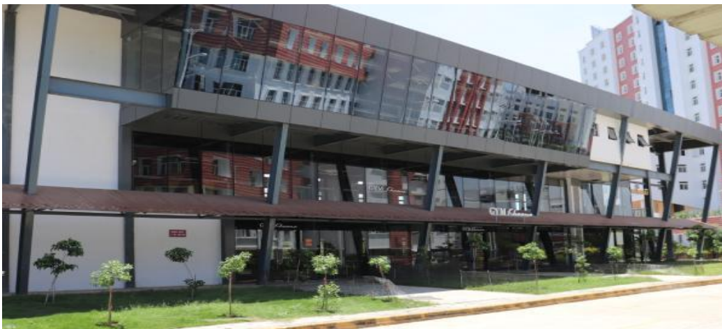
Canteen and Food Court Complex