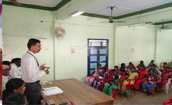
MEDP - Training Tailoring Skill Development

VIT is an endorsed JLG Promoting Institution associated with NABARD Tiruvannamalai and extends his supports via financial support for awareness creation and capacity building of all stakeholders under the JLG Scheme In Jawadhu Hills, Tiruvannamalai District consists of 11 Village Panchayats. Until the year 2019-20, VIET linked 147 JLGs and 19 farmers group for credit linkage for an amount of INR 442,00,000-00 with support of NABARD and Indian Bank, Jamunamarthur . Every year the Mega Loan mela is organized and loans are disbursed to JLGs for livelihood development activities with subsidy ( https://vit.ac.in/about/community-outreach/projectsandprograms ).