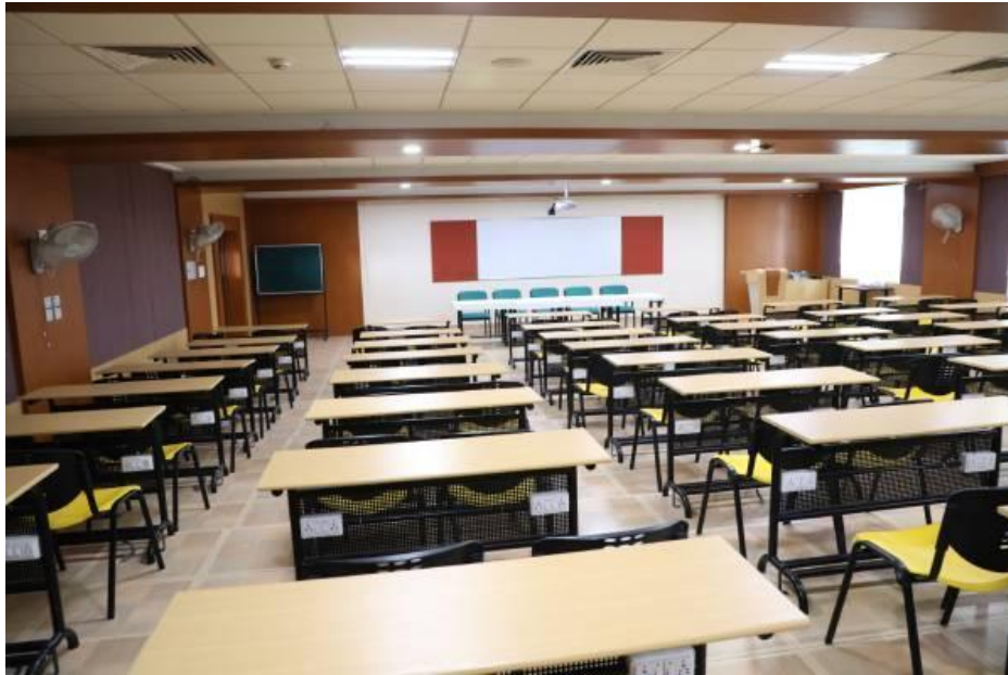
Smart Classroom (Interior View)

every available resource from one point at the click of a button. These classrooms are also often used for seminars and events from time to time. Video capturing facilities are also available for enhancing the teaching-learning process.