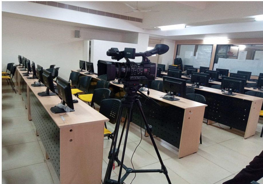
Video capturing facility