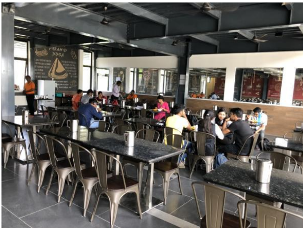
Canteen (Interior View)