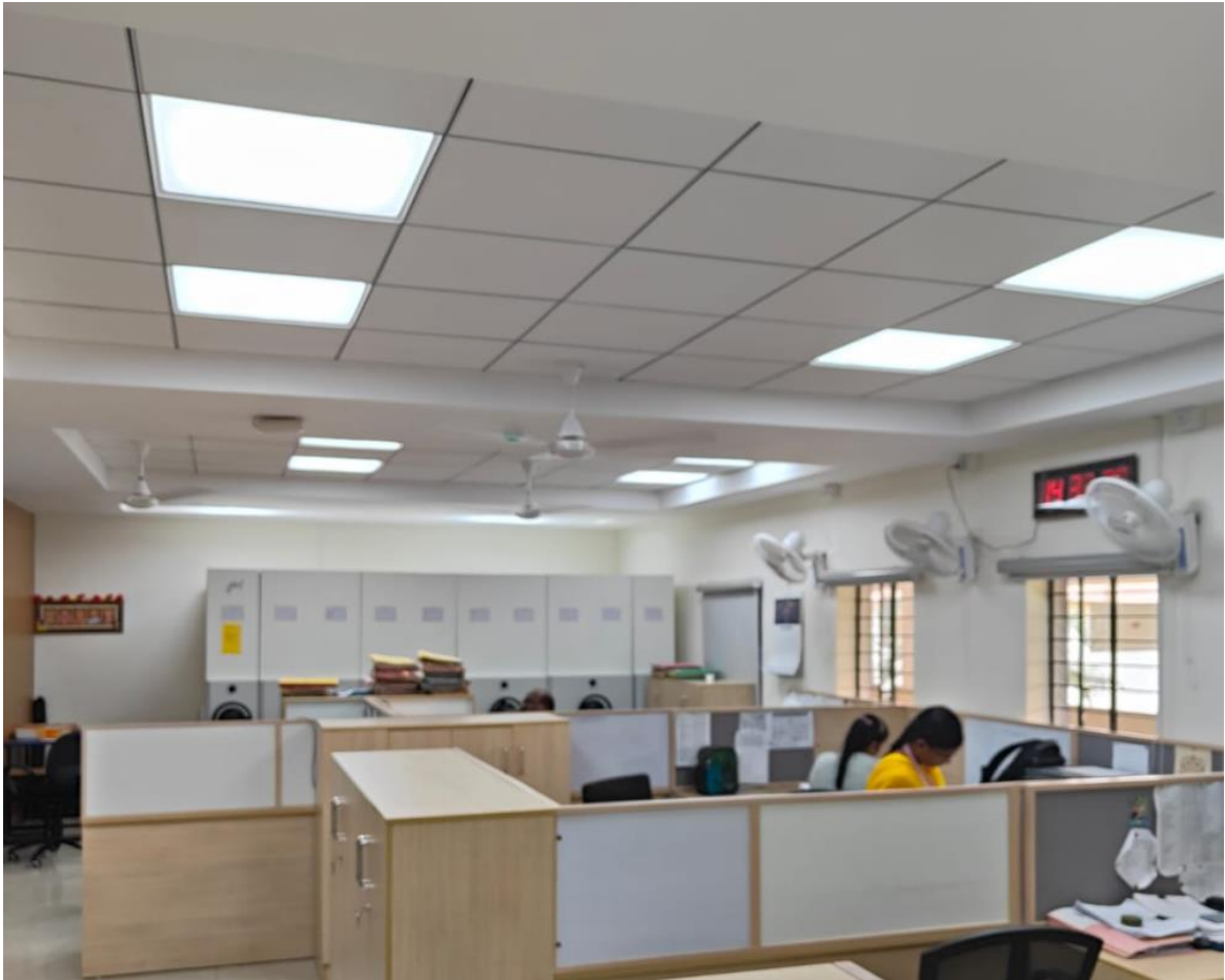
LED Bulbs in Administrative Offices