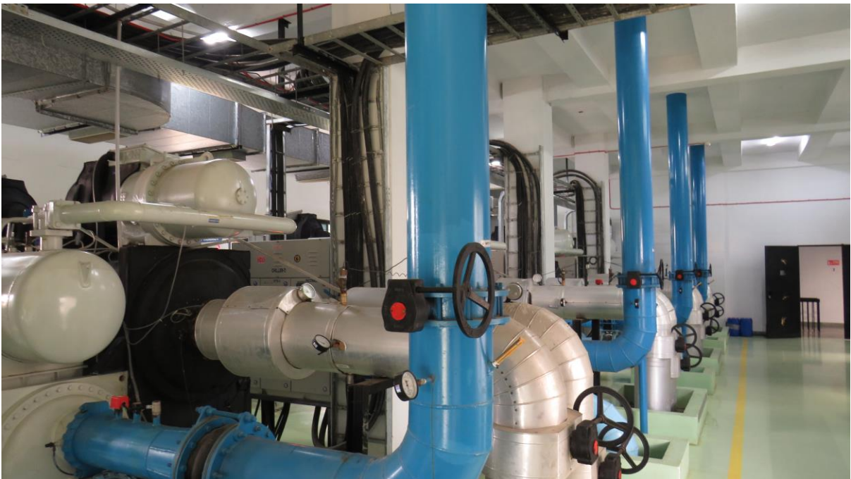
Centralised Chiller Pump Room