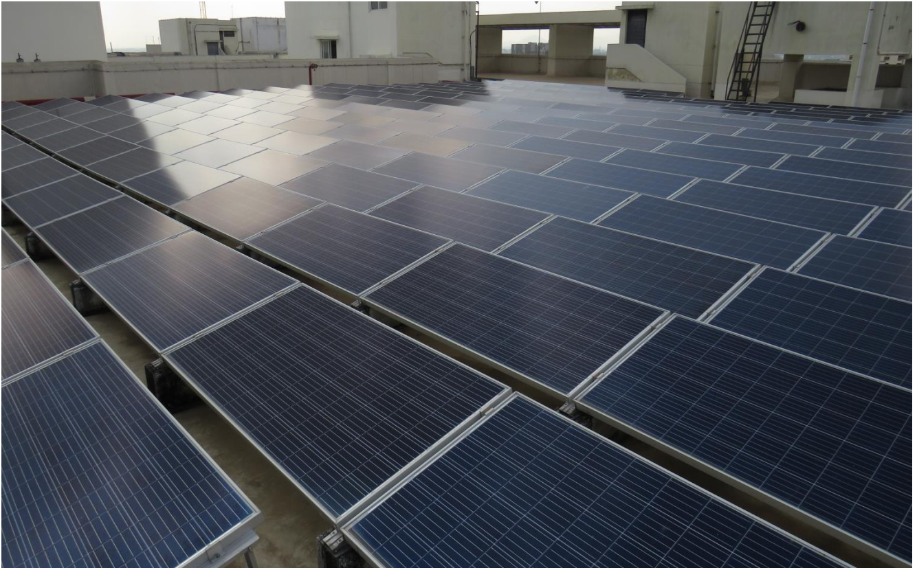
Solar system for saving energy