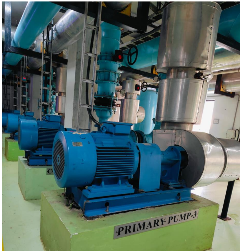
Chiller : Primary Pump