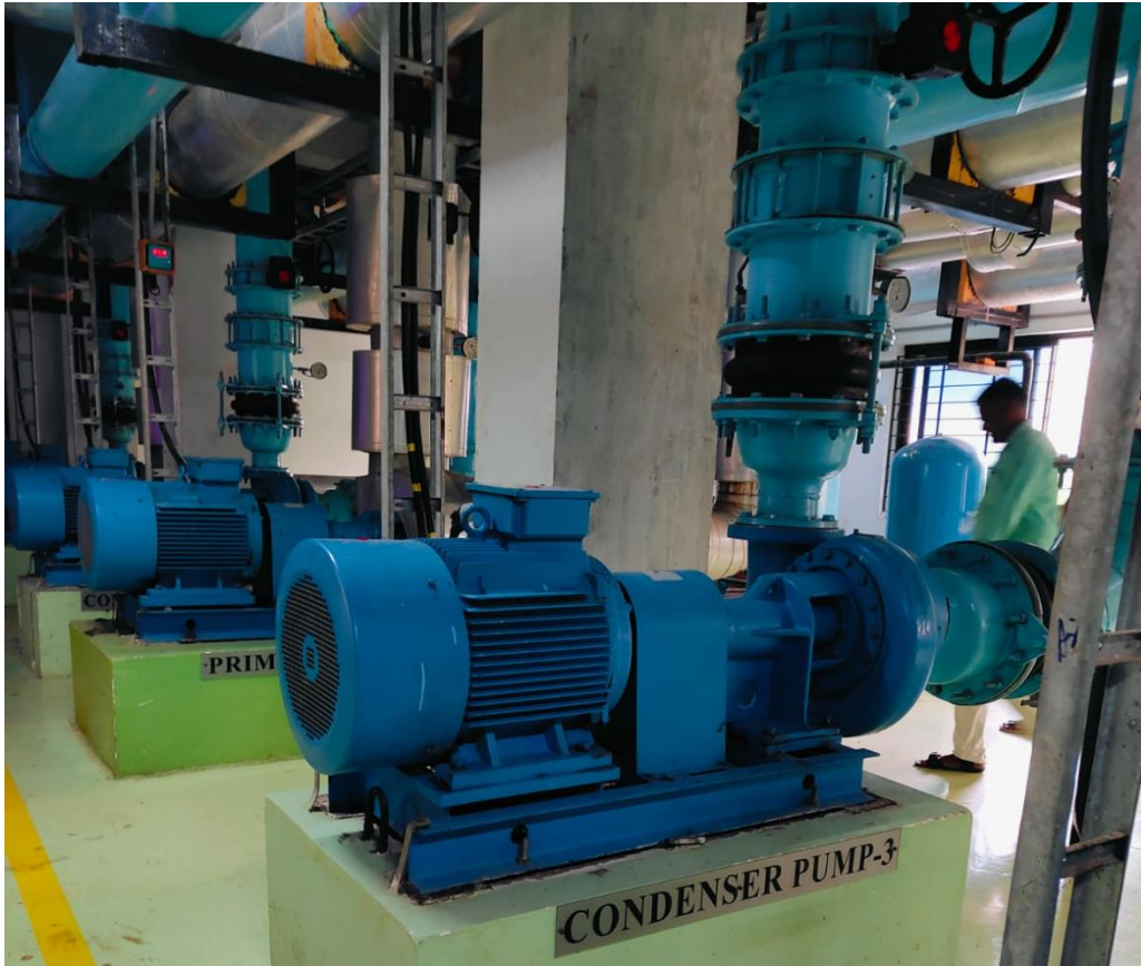
Chiller : Condenser Pump