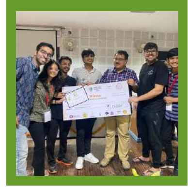
Team Craft 404

3 teams from VIT Vellore Won the Smart India Hackathon 2022 challenge under the category of health care, student innovation and education a Prize Money of Rs. 1 Lakh per team conducted by the Ministry of Education's Innovation Cell .