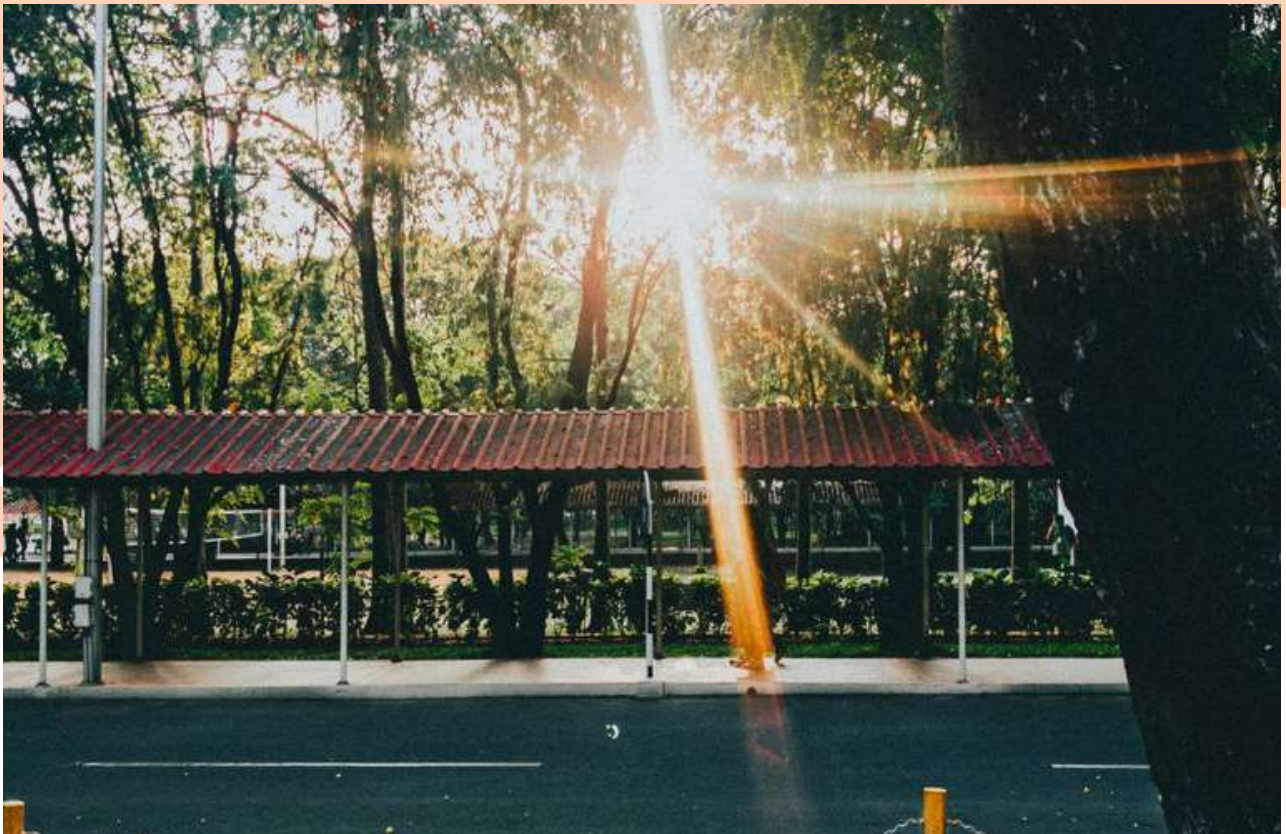
Greenos, 07:00AM in the morning