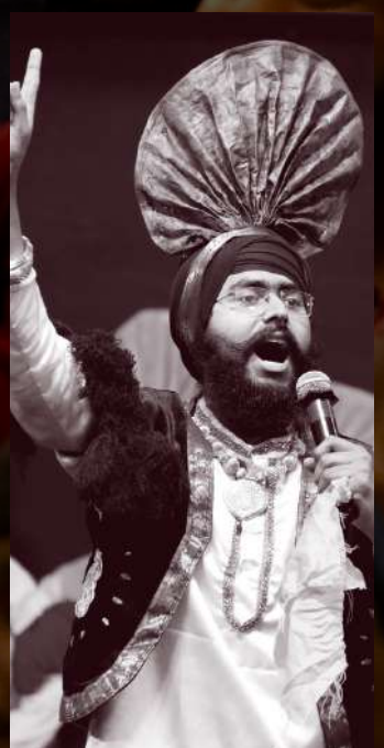
"Dill-Da-Ni-Mada... Tera Sidhu Moosewala" A tribute to the unjust and tragic demise of the great Punjabi artist Shubhdeep Singh Sidhu.