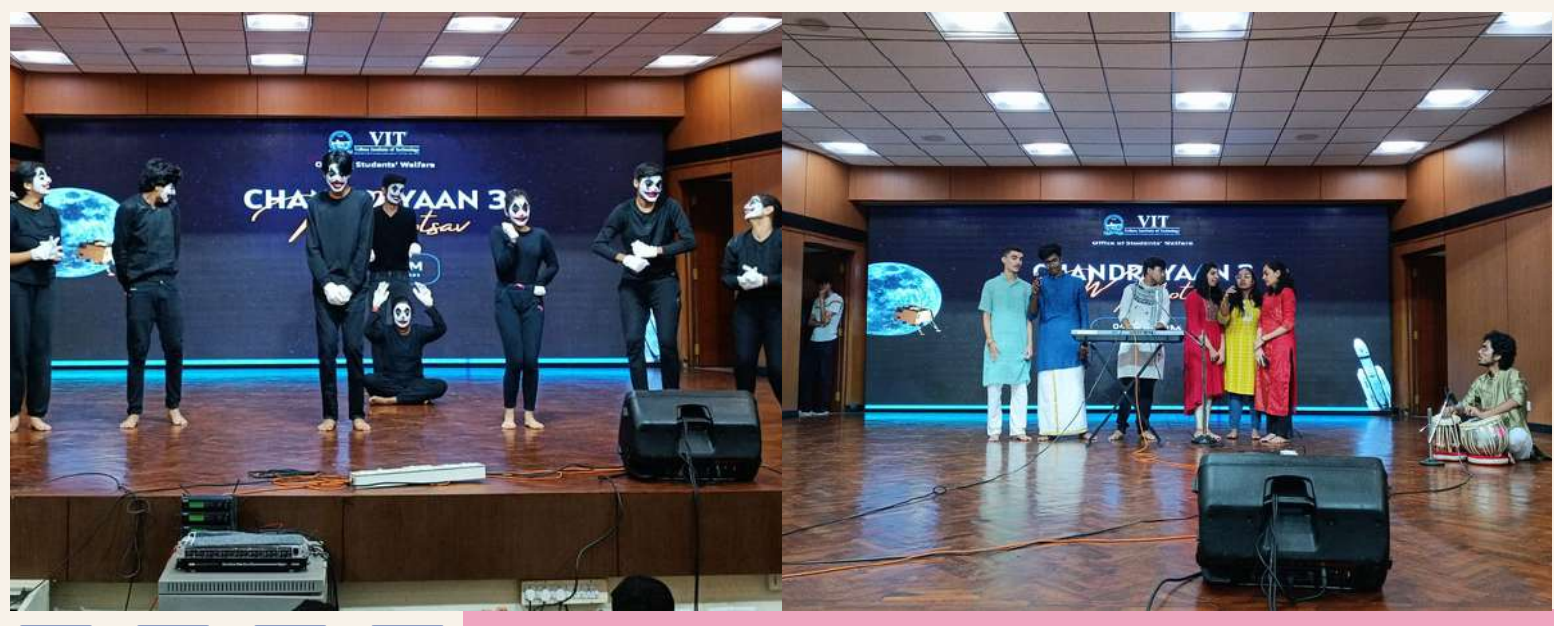
From 4<sup>th</sup>September at Anna Auditorium

The Office of Students' Welfare, along with the collaborating clubs, deserves commendation for organizing such a splendid event that left a lasting impression on all those who attended. Chandrayan-3 Mahotsav 2023 will undoubtedly be remembered as a highlight of the cultural calendar at VIT.