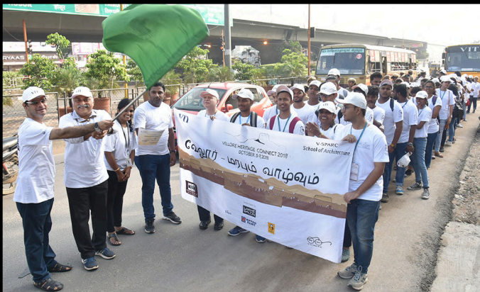
VELLORE HERITAGE CONNECT