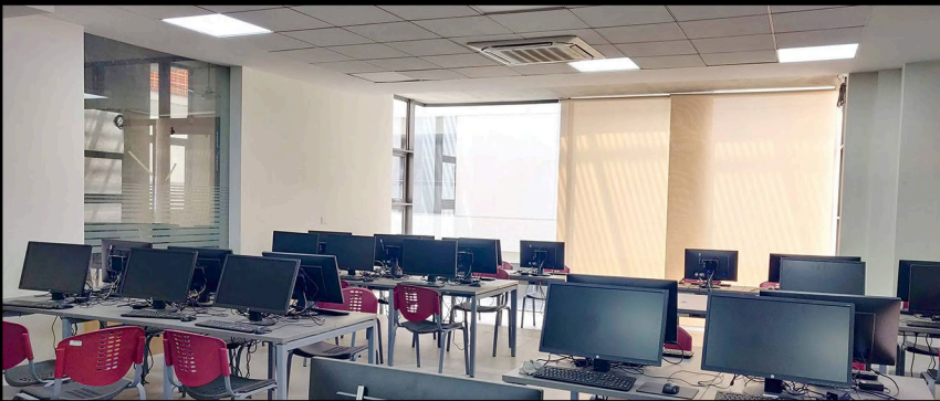
DIGITAL ARCHITECTURE LAB