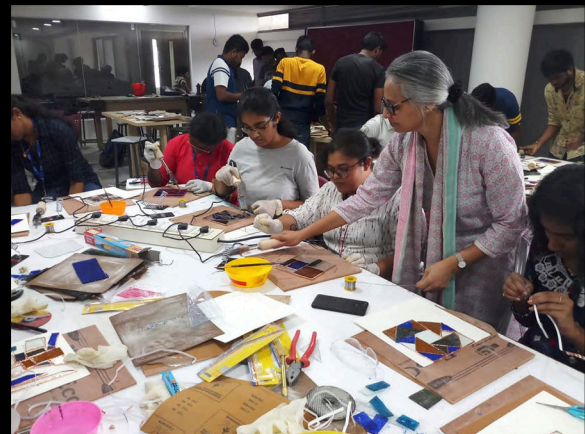
ART AND CRAFT WORKSHOP