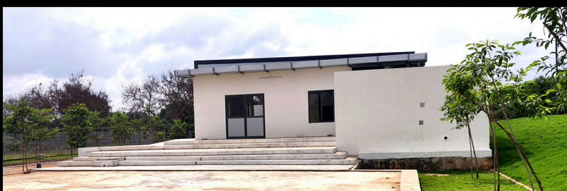
CARPENTRY AND FABRICATION WORKSHOP