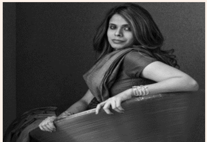
Dr. Meena Kandasamy

Described by the Independent as a 'one-woman, agit-prop literary-political movement', Meena Kandasamy is a poet, writer, translator, anti-caste activist and academic based in India. Her extensive corpus includes two poetry collections, Touch (2006) and Ms Militancy (2010), as well as three novels, The Gypsy Goddess (2014), When I Hit You (2017) and Exquisite Cadavers (2019). In 2022, she was elected as a Fellow of the Royal Society of Literature (FRSL) and was also awarded the PEN Hermann Kesten Prize for her writing and work as a 'fearless fighter for democracy, human rights and the free word.' Her latest published work is Tomorrow Someone Will Arrest You, a collection of political poetry written over the last decade.