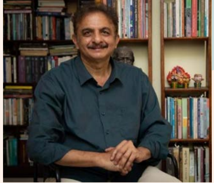
Dr. Jayant Kaikini