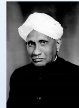
Sir. C. V. Raman (1888 - 1970)

Every year since 1987, National Science Day is celebrated on 28th February to honor the great Indian Physicist Sir. C. V. Raman who won the Nobel prize in Physics. It was on this day in 1928, his discovery of the Raman Effect came to light at Indian Association for the Cultivation of Science, Kolkata. This breakthrough discovery brought the first Nobel prize in science for our country in 1930. Hence, the nation celebrates it as the National Science Day, an important day for Indian Scientific Community. It is a day to innervate young minds and to impart scientific spirit.