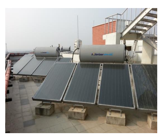
Solar water heater in Academic and Hostels building