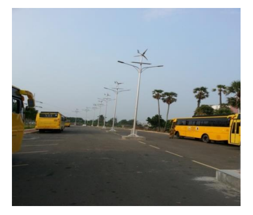
Hybrid type (solar & wind) street lighting