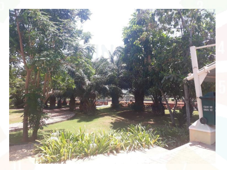
Planting more trees at VIT Chennai campus