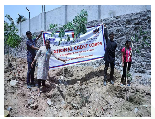
NCC and NSS volunteers also participated in planting more trees near by area