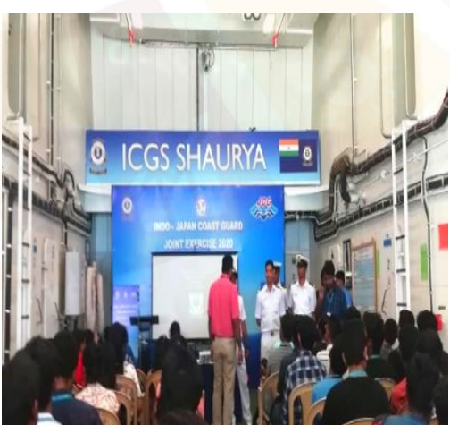
Indian Coast Guard- Ship Visit