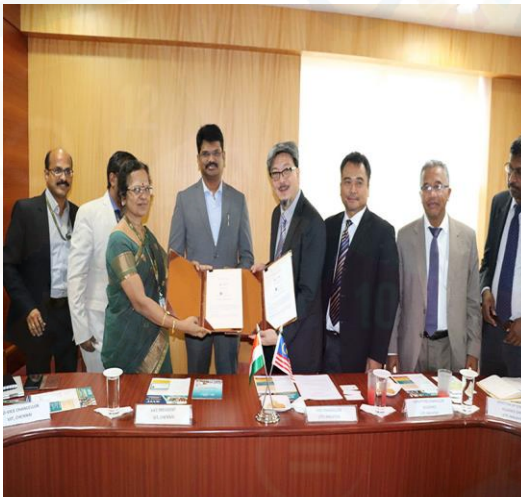
MoU with UTP -2019

VIT University has signed MoUs with University of Nottingham, UK, Binghamton University, Georgia State University-USA, RIT-USA, Universiti Teknologi Petranos(UTP), Malaysia, A Star Research entities, Singapore and so on., for academic cooperation to promote the advancement of learning through research, exchange and cooperation in teaching with focus on Faculty and Student exchange programmes, host lectures, seminars / webinars, organize joint research projects with specific focus on inter-disciplinary and trans-disciplinary domains, set up Centre of Excellence and assist in other academic activities that will be of joint interest to both the Universities.