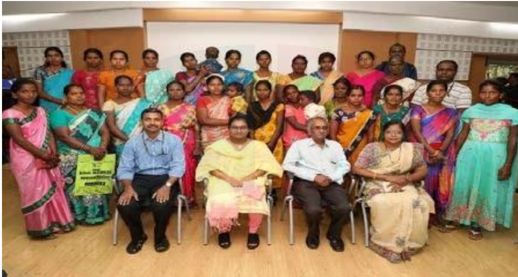
Mini Millets Value Addition EDP Training Programme - Date: 04.12.2019 to 07.12.2019