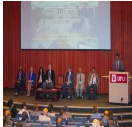
INDIANA SUMMIT -2019