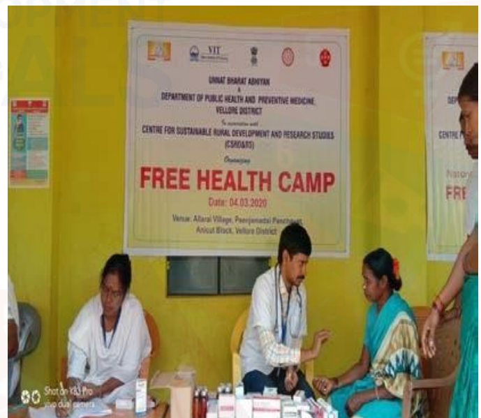
TB SCREENING AWARENESS CAMP & HEALTH CAMP IN PEENJAMANDHAI VILLAGE