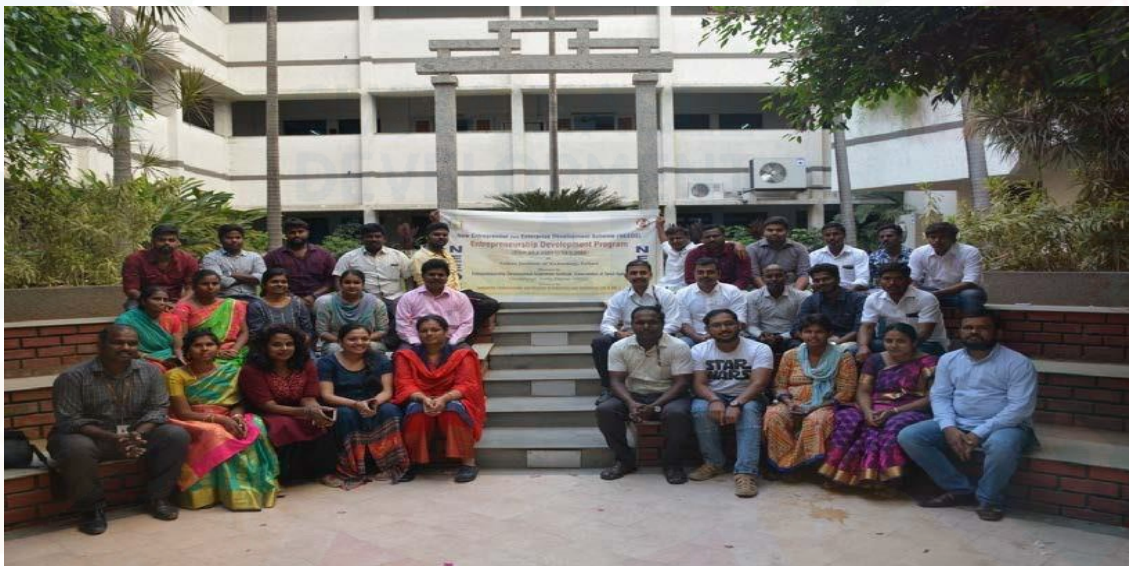
NEEDS – EDP – From 13.02.2020 to 13.03.2020