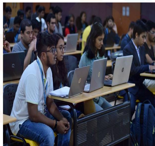
Students participating in AI Conclave