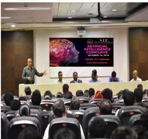
Keynote Address- AI Conclave

Image and Voice recognition, Video and Game streaming, Content and video based image recommendation for prediction of chronic diseases, Reinforcement Learning, Influence of AI/ML in financial operations. Panel discussion on “Key challenges in adoption of AI in India” was a brain-storming session with lots of takeaway for the participants.