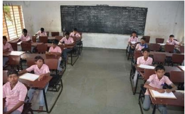
GV SCHOOL DEVELOPMENT - PROVIDED 100 DUAL BENCH & DESK FOR GOVT. HR. SEC. SCHOOL – PERANPATTU VILLAGE – GUDIYATHAM BLOCK-VELLORE DATE : 07.01.2020