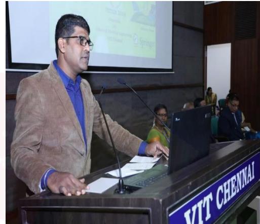
A GLIMPSE OF PECCON-2019