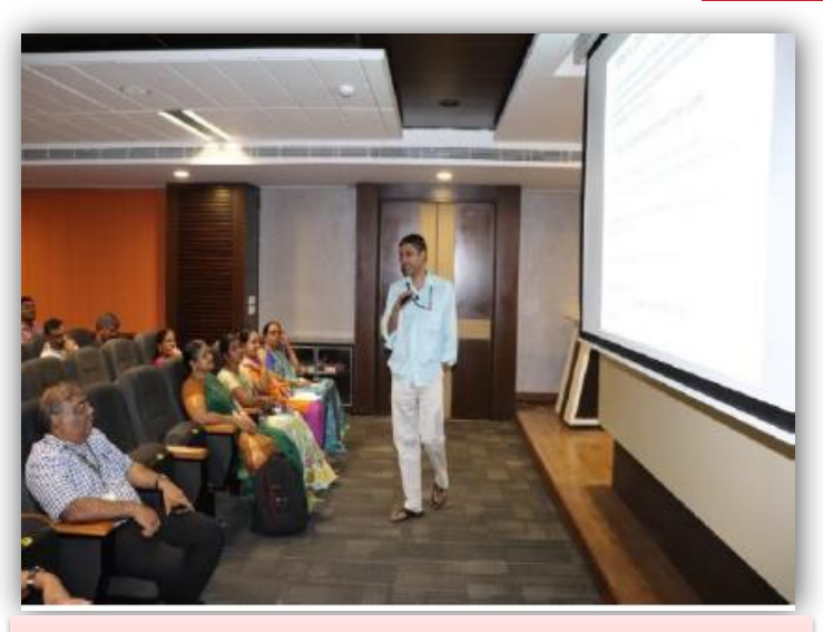
Lecture by resource person on Outcome Based Education (OBE)