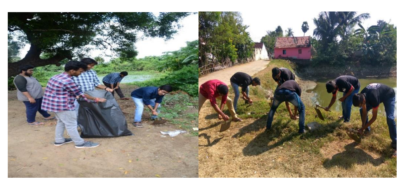
Volunteers of NSS cleaning the water bodies of plastic and other toxic materials from Kayar Village near Thiruporur with the support from VIT Management