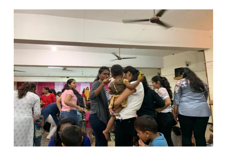
Holi - The festival of spring, colors, love and forgiveness is the most enjoyable event at hostels and is celebrated with colours, DJ and yummy treats. This year's Holi was celebrated on the 10<sup>th</sup> of March, 2020.

Kasam Children's Home – A visit to the home for ladies hostel students was organised on the 29<sup>th</sup> of October, 2019. Such visits can create a spark in the minds of students which may help serve in bringing light in the lives of the under privileged in future.