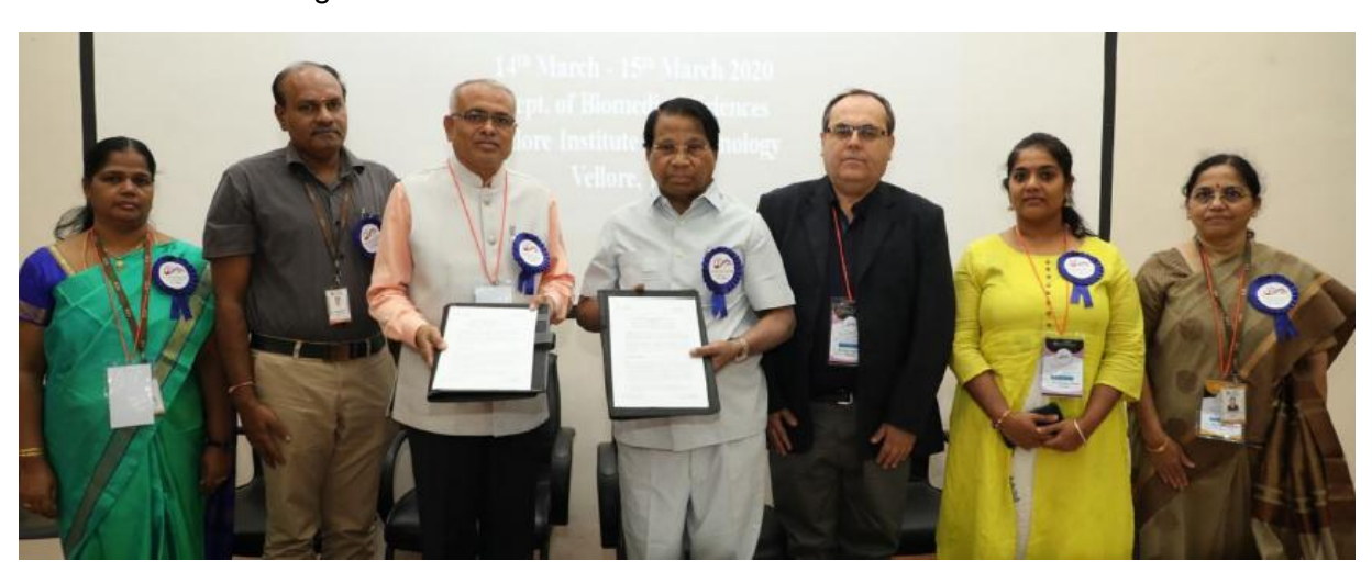
Signing of MoU between Vellore Institute of Technology (VIT) and Organization for Rare Diseases (ORDI) on 14th March , 2020

VIT is renowned for its no discrimination policies especially when it comes to students admissions, faculty and staff recruitments and is a safe haven for career development of every individual youth and women. Women occupying posts of Deans, Directors, Professors and Staffs in Schools and Centres and their contribution to academics and research can be observed through the home website (vit.ac.in). Over 36,000 students, with nearly one-third of them women are being educated at VIT.