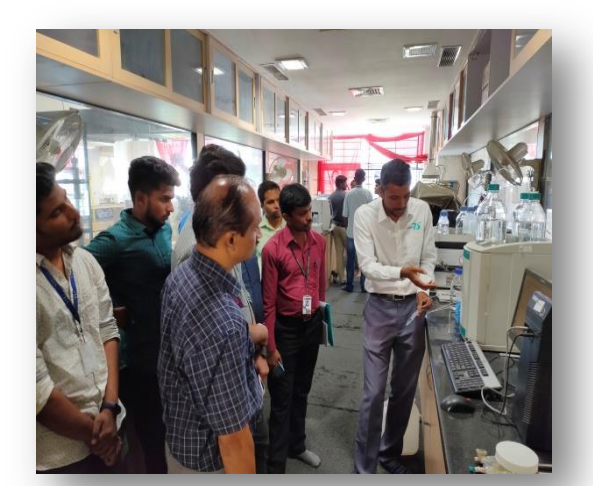
Workshop on "Ion Chromatography and Water Purification Systems

Affordable and Synergetic solutions for water (Water-IC for SUTRAM of EASY Water (SUTHRAM) Project a water innovative centre collaborated with 8 partner institutions sponsored by DST, WTI Govt. of India (Cost of project is 893 lakhs). The research group of VIT Chennai is working on water and wastewater quality analysis and process design, Innovative Nano material synthesis and performance studies, Solid waste