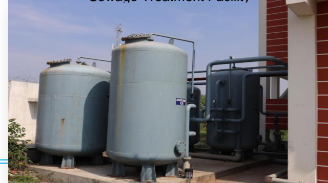
Sewage Treatment Facility