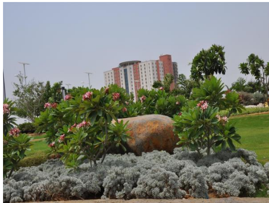
A Green Campus

The sprawling VIT Chennai Campus is an energy efficient campus. The institute has won the accolade of green rated infrastructure. Solar panels are installed in abundance for efficient energy storage and conversion.