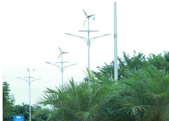
SOLAR-WIND Powered LED Street Light