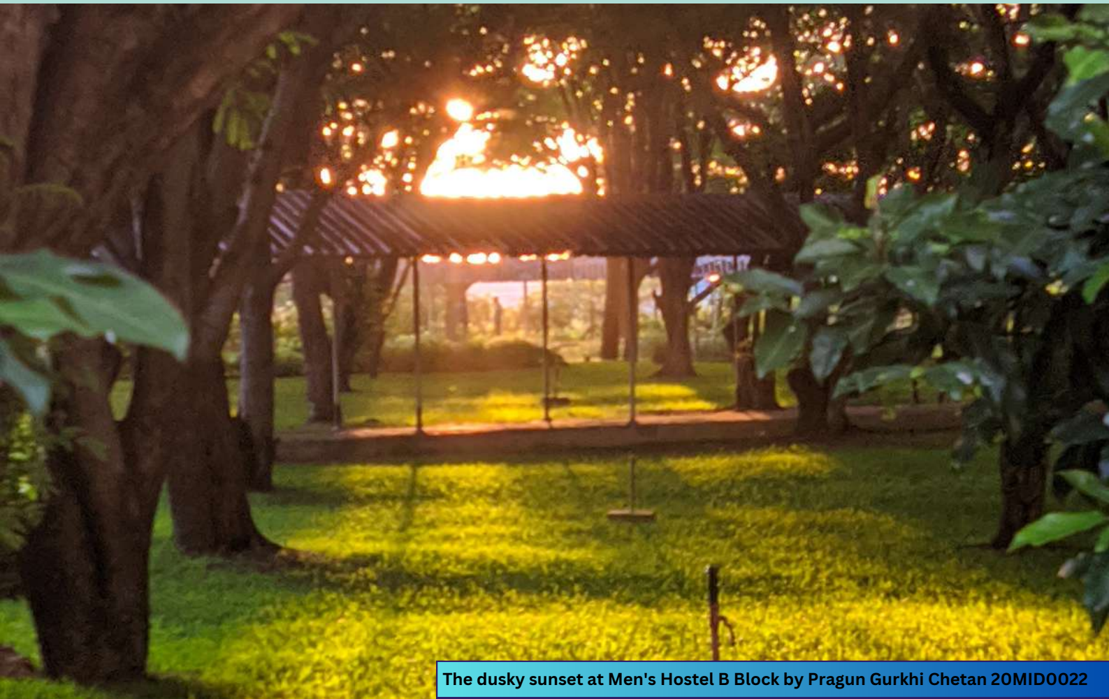
The dusky sunset at Men's Hostel B Block

VIT Click: Click pictures inside/of the campus and mention date, time & location of the same to get a chance to be featured in the next SW Newsletter.