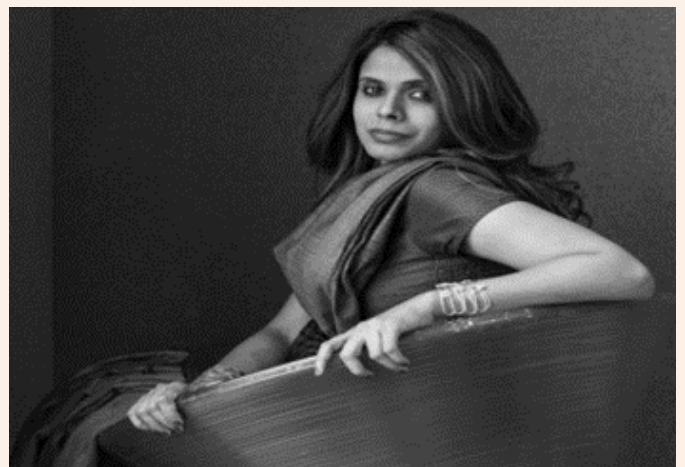
Dr. Meena Kandasamy

Described by the Independent as a 'one-woman, agit-prop literary-political movement', Meena Kandasamy is a poet, writer, translator, anti-caste activist and academic based in India. Her extensive corpus includes two poetry collections, Touch (2006) and Ms Militancy (2010), as well as three novels, The Gypsy Goddess (2014), When I Hit You (2017) and Exquisite Cadavers (2019). In 2022, she was elected as a Fellow of the Royal Society of Literature (FRSL) and was also awarded the PEN Hermann Kesten Prize for her writing and work as a 'fearless fighter for democracy, human rights and the free word.' Her latest published work is Tomorrow Someone Will Arrest You, a collection of political poetry written over the last decade.